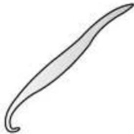
Hookworm (5x actual size)

Hookworms are intestinal parasites of the cat and dog. Their name is derived from the hook-like mouthparts they use to anchor to the lining of the intestinal wall. They are only about 1/8" (two to three mm) long and so small in diameter that they are barely visible to the naked eye.